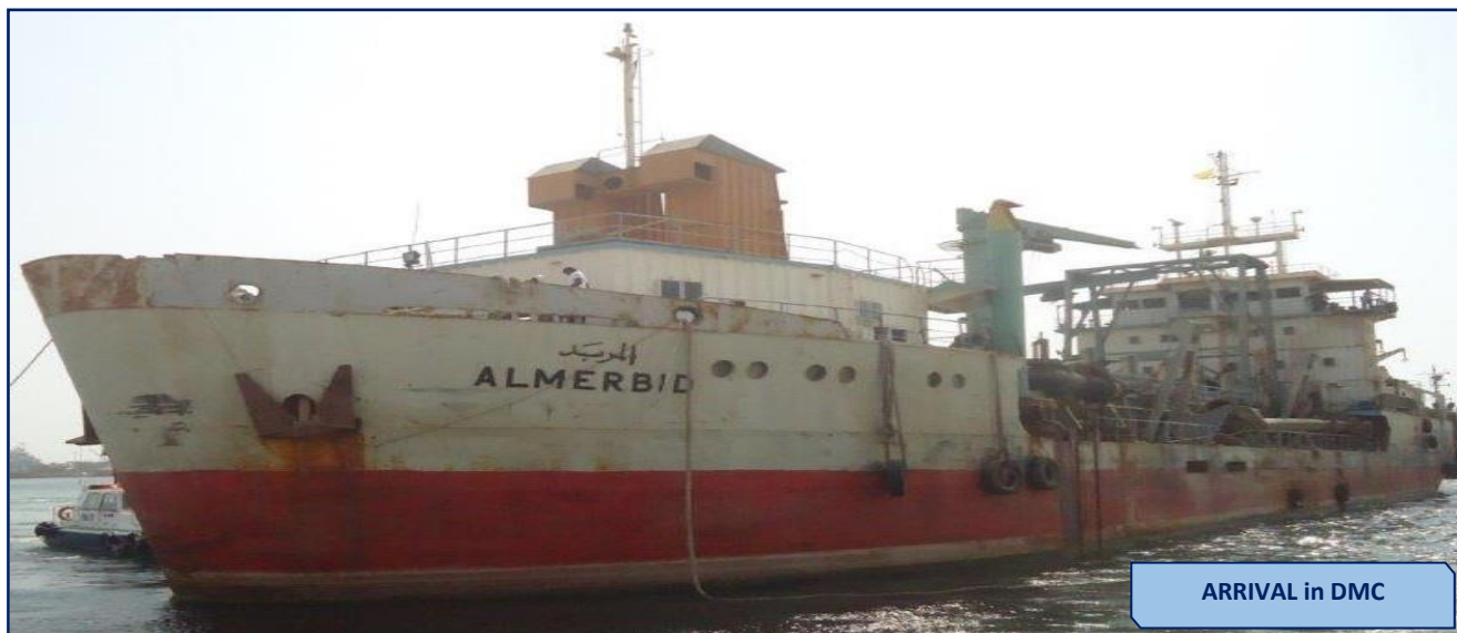
ARRIVAL in DMC

NORDMARIN LLC formerly GMMOSTECH Marine and Technical Services LLC