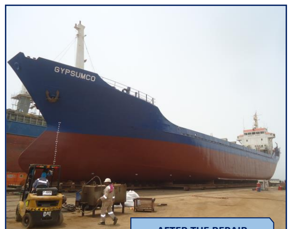
AFTER THE REPAIR