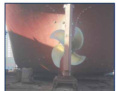
AFTER THE REPAIR

RED SEA 1 undocked on January 16, 2019 and after all the jobs have been completed to the full satisfaction of the client, the vessel sailed out from DMC on February 05, 2019.