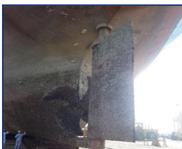
BEFORE THE REPAIR

RED SEA 1 undocked on January 16, 2019 and after all the jobs have been completed to the full satisfaction of the client, the vessel sailed out from DMC on February 05, 2019.