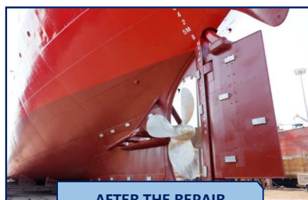
AFTER THE REPAIR