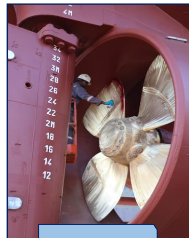
CPP Stern Thruster